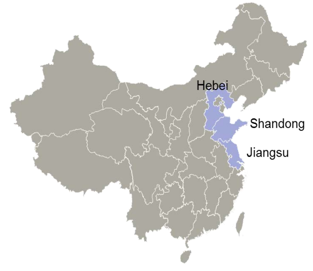
Figure 1 Provincial map of China with provinces particularly affected by closures of chemical companies.

So far, the coastal provinces of Shandong and Jiangsu have announced the most wide-ranging plans for factory closures (see Fig. 1). In addition, due to its closes proximity to the Beijing/Tianjin cluster, Hebei province is also likely to close a substantial number of chemical factories. In addition, it is very likely that other provinces – first those on the Chinese seaboard, but later also inland provinces – will increasingly be affected.